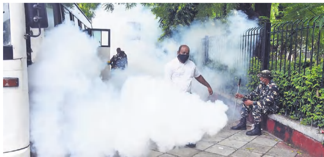
BETTER PREVENT THAN CURE

A NDMC worker fumigates areas around Jantar Mantar to prevent spread of malaria and dengue