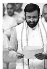
विधानसभा में यंत्रणाओं की जानकारी देते सीएम कैप्टन खन्ना

विधानसभा में मुख्यमंत्री की घोषणा पर जारी हुई अधिसूचना