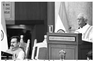
हरियाणा विधानसभा में सरकार का रोड मैप पेश करते राज्यपाल बहादुर दत्तात्रेय